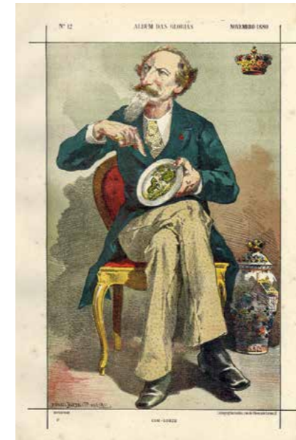
1 — King Consort (Ferdinand II of Portugal showing his own ceramics) by Rafael Bordalo Pinheiro, in Album das Glórias (Lisbon, vol. 1, no. 12, November 1880).