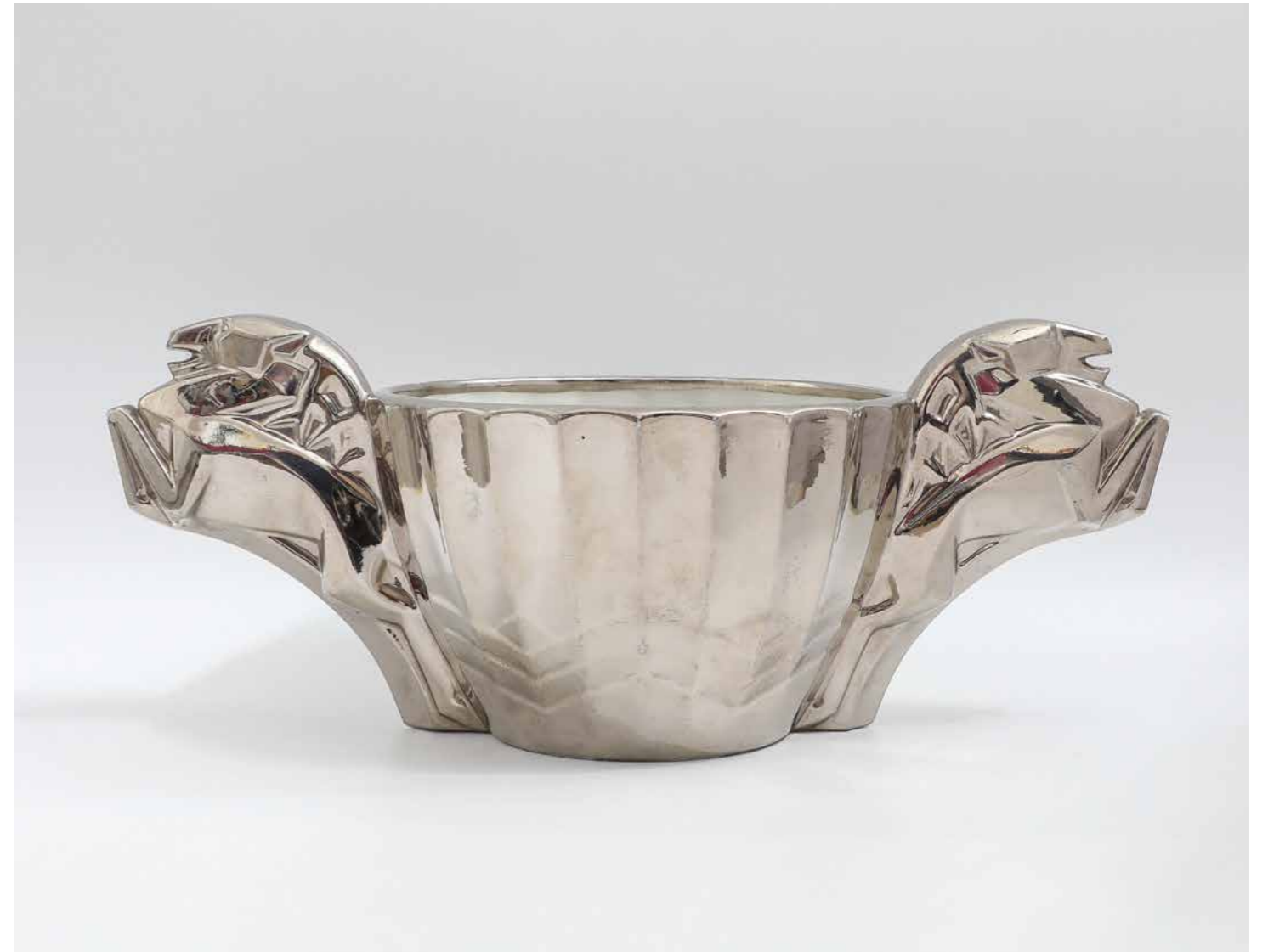
20 DONALD GILBERT (designer), bowl , c. 1935, Fábrica de Loiça de Sacavém, model 259 , ceramic, moulded, 17.5 × 42 × 21, T80