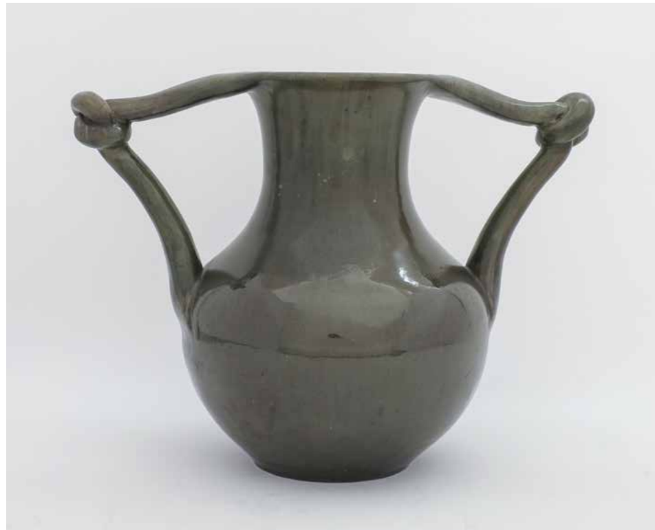
5 COSTA MOTA SOBRINHO, Knot vase , 1912, Fábrica de Faianças das Caldas da Rainha, ceramic, thrown and modelled, 24 × 32.5 × 19, A253