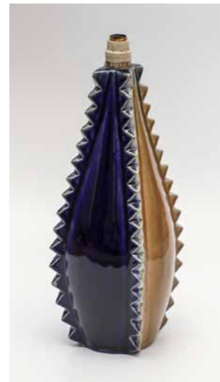
3.28 __ António Araújo Soares's sketches of ceramics, 1955 (on display in Museu da Fábrica da Louça Regional de Viana do Castelo). Lamp base, c. 1955, Campos & Filhos, Aveiro, stoneware, moulded, 27 x 11, inv. no. A581