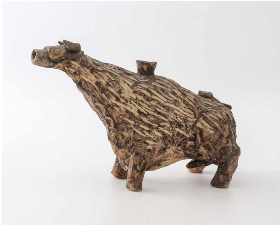
26 VICTOR PALLA, aquamanile Bull , c. 1950, earthenware, modelled, 16 × 23 × 8, A336