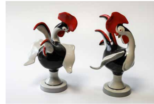
3.29 __ António Pedro, Modern cockerels , early 1950s, Campos & Filhos, Meadela, ceramic, moulded, 15 x 10 x 9.5, inv. nos A189A, A189B

ography, costumes and advertising” as well as “painting, sculpture, drawings and ceramics”. Although in the recent past many facets of his work received a great deal of attention, the ceramics to which he dedicated no more than half a dozen years continues to be neglected by both researchers and museums. This is not completely surprising since, in terms of numbers, his production was rather limited and many items are extremely fragile, which also contributed to their vanishing.