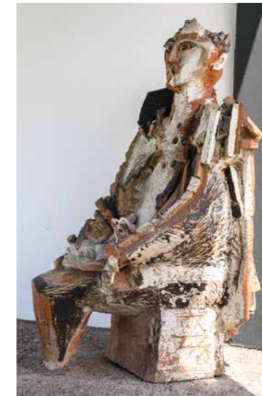
4.4 __ Luís Ferreira da Silva, King Luís I , 1989, CENCAL, ceramic, modelled, CENCAL collection, Caldas da Rainha

ized a retrospective exhibition of her work dating from the mid-1950s to the year of the show. In 1968, she moved to Angola, where she continued to make ceramics, but in 1974 returned to Portugal just before the independence of the African country. In the following decade, Cecília de Sousa focused on larger surfaces and Abstractionism, painting tile panels and relatively large plaques such as one from 1987 (cat. 200). In the late 1990s, she developed new research on materials, pigments and firing techniques, culminating in a solo show at Valbom Gallery, in Lisbon, in 2010, a rare occasion in which an art gallery devoted in this period, time and space to a ceramicist's work. The exhibition revealed a new facet, since her ceramics, made in highly textured stoneware, became more sculptural and conceptual. Some have more mundane dimensions (cat. 209), but the majority are large and intended for outdoors. The latter recall totems, are built in large blocks and are unglazed and stained with pigments, such as those installed in 1997, at Olivais Sul, in Lisbon (fig. 4.6).