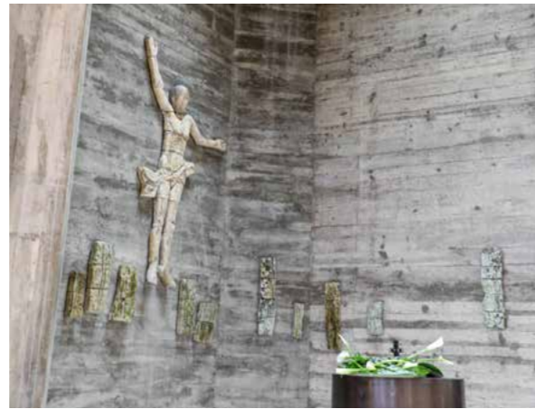
4.3 __ Júlio Resende, Ascension of Jesus and Via Sacra (detail), 1987, ceramic, modelled, 210 x 122 (figure), Church of Our Lady of Boavista, Porto

1993, in Suzana Barros Lapa's collection, Lapa demonstrated yet again his extraordinary technical skills, imagination and visual culture, which was often influenced by the arts from the Far East. During this period, he often worked with metallic oxides, resulting in iridescent types of lustre, which he used in masks entitled Oracles and in relief tiles with which he created tile panels.