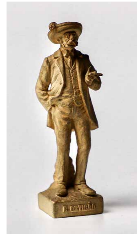
1.1 __ Eduardo Mafra Elias, Miniature of Ramalho Ortigão , 1920–1940, Caldas da Rainha, clay, moulded and modelled, 7.5 × 1.8 × 1.7, inv. no. A296

Thanks to the efforts of the local Museu da Cerâmica (museum of ceramics) and some authors, the work