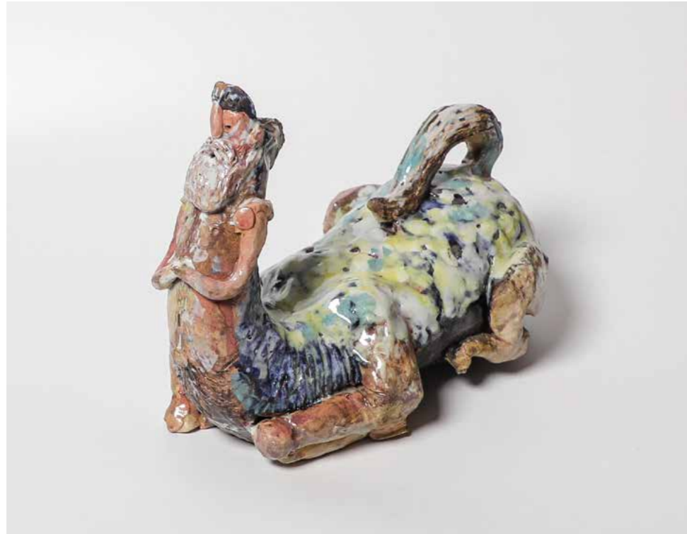
27 VICTOR PALLA, Centaur , c. 1950, earthenware, modelled, 20 × 24.5 × 15, A620