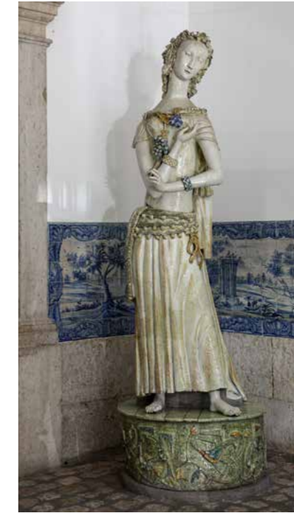
2.6 __ Jorge Barradas, Autumn , 1959, Viúva Lamego, ceramic, modelled, 285 × 94 (with base), Museu de Lisboa (Pimenta Palace), inv. no. MC.CER.0335, Lisbon

Although his illustrations, paintings, ceramics and glass are frequently selected to be part of temporary exhibitions in public museums and private institutions, Barradas has yet to have a much-deserved retrospective exhibition. This is probably due to two