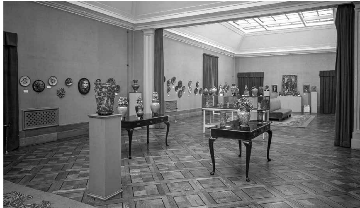
2.5 __ Two views of Jorge Barradas's second exhibition of his ceramic work, held in 1948 at S.N.I., Lisbon, where the Old shepherd (cat. 22) is on display in the more prominent area.

ornaments and of clear Surrealist flavour appears in profile.