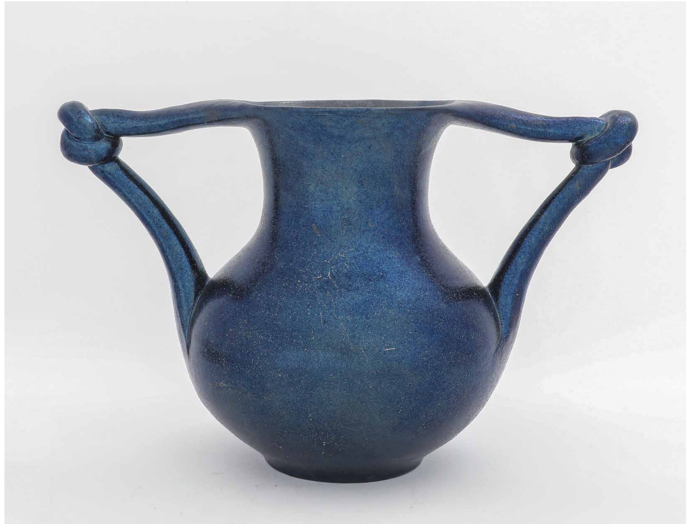
6 COSTA MOTA SOBRINHO, Knot vase , 1912, Fábrica de Faianças das Caldas da Rainha, ceramic, thrown and modelled, 20.5 × 34 × 16.5, A521