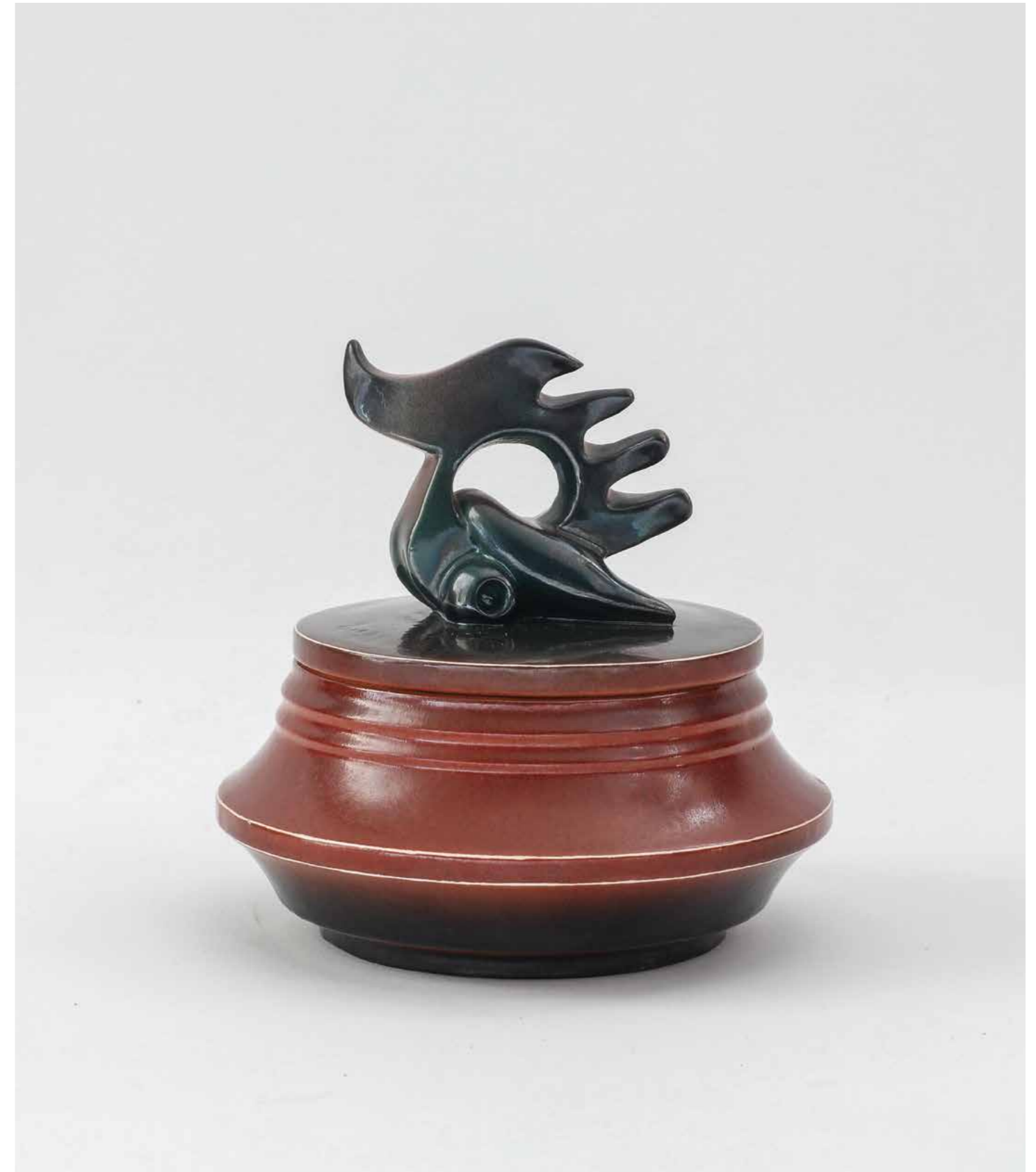
39 ANTÓNIO PEDRO, jar, c. 1952, Oficina de Moledo, ceramic, moulded: 12 × 13,5, A602