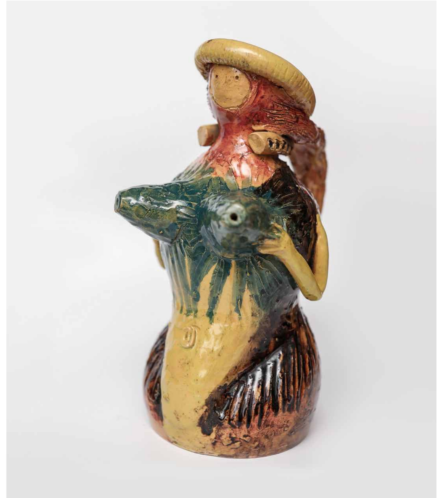
28 VICTOR PALLA, jug , 1949, earthenware, modelled, 32 × 15 × 22, A619