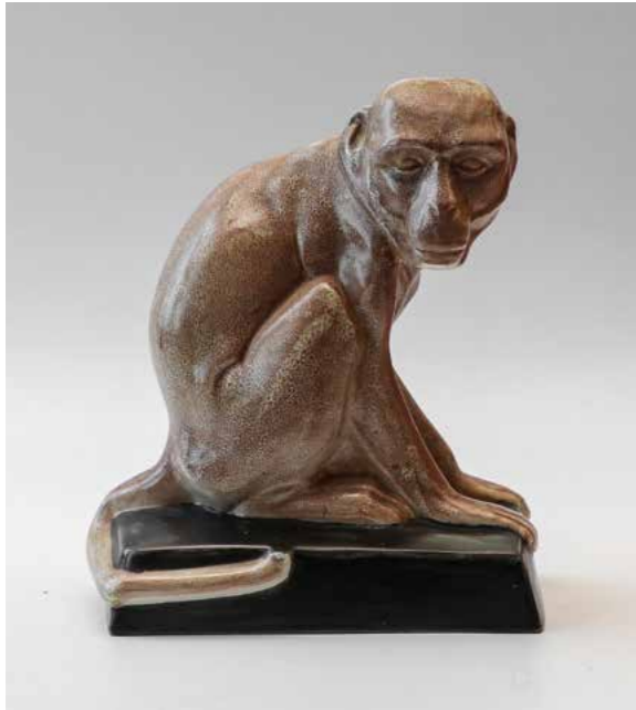
18 DONALD GILBERT (designer), Monkey , c. 1935, Fábrica de Loiça de Sacavém, model 191 , ceramic, moulded, 23 × 21 × 11, T65