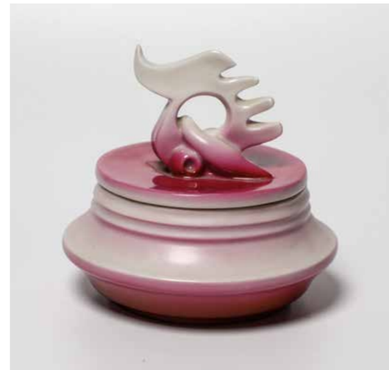
38 ANTÓNIO PEDRO, jar, 1952, Oficina de Moledo, ceramic, moulded: 11 × 12, A181