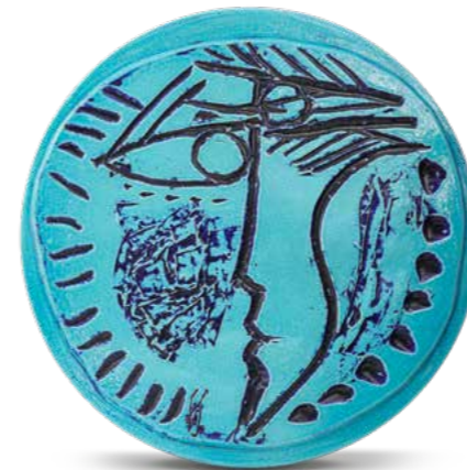
4.5 __ Luís Ferreira da Silva, Self-portrait (tondo), c. 2005, CENCAL, Caldas da Rainha, ceramic, moulded, 2 x 52, inv. no. A373

Cecília de Sousa obtained major recognition in 2004 when the Museu Nacional do Azulejo organ-